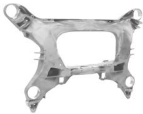
Albert Handtmann Metallgusswerk GmbH & Co. KG