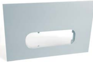
TORUN Bark Magnesium GmbH